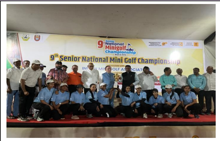
9th National Mini Golf Championship was held at Nagpur Maharashtra in which 4 students of our school were selected to represent MP Team for this tournament.