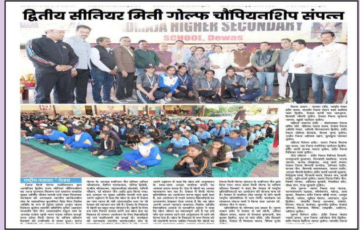
Open Mini Golf State Tournament was held at Dewas in which 19 students of our school participated and 14 students got medal.